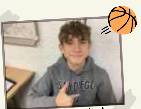
Most likely to be best at Sports