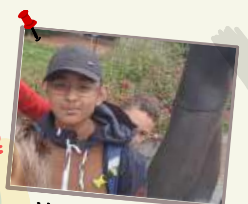
Most likely to graduate very well