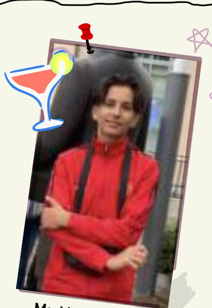
Most likely to become a millionaire