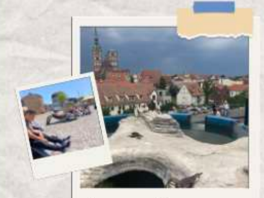
day 4. Museeum

The school trip was very funny and knowledgable because we were in different areas of Strahsund