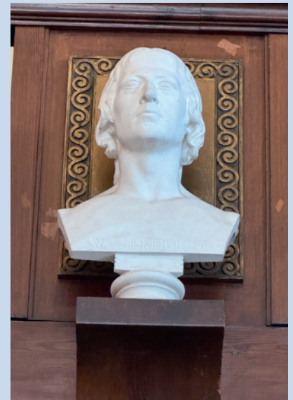
Wilhelm von Humboldt 1767–1835

Educate yourself and then make an impact on others by who you are!